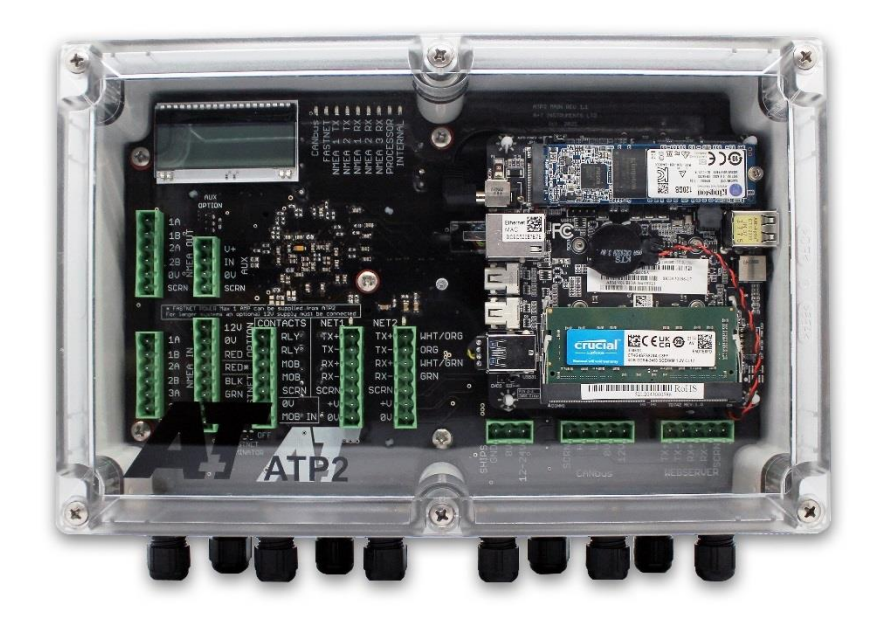
ATP2 Instrument Processor from A+T

The ATP2 processor is designed for distributed applications using an Ethernet bus. The processor is shown below and has a wide range of internal interfaces. Sensors are connected with distributed units on an Ethernet network which also drives the full range of A+T displays.