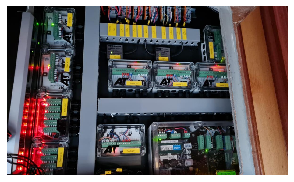
ATP2 Processor installation on SY Athos

A recent installation was on the 62m schooner Athos to replace a failing WTP3 system. This complex system with 30 displays, over twenty sensor inputs and wind input on both masts was installed and commissioned by Osprey Technical Consulting in just a few days